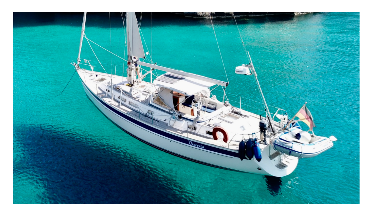
Hallberg-Rassy 43 - Victoria, in top conditions, fully equipped, for sale EUR 300.000

Victoria is in top conditions, with all annual services maintained and fully equipped with many up to date extras, ready to sail! Victoria is registered in Germany and the EU tax has been paid. Push button sailing for small crew perfect, hydraulic main and jib furling and all electrical winches. The boat has a strong Volvo Penta 75hp diesel engine and 8hp bow thruster. Large water and fuel tanks make the yacht independent, in combination with generator, solar cells and a washing machine. Victoria is fully air conditioned and equipped with Webasto heating system. The navigation instruments are up to date including a new Raymarine Axiom plotter. The boat is currently in Greece.